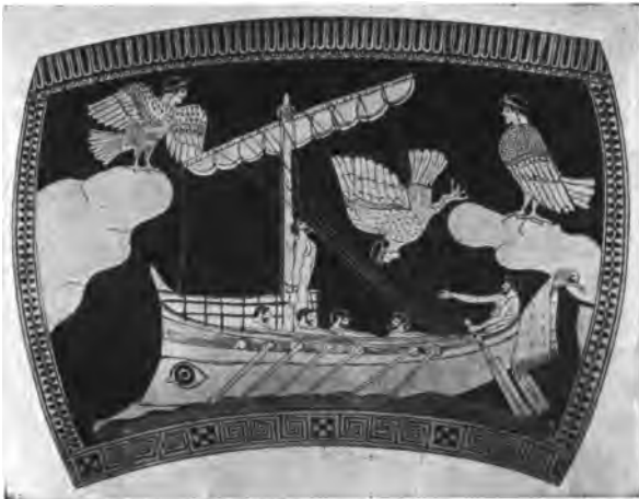
Fig. 93. Odysseus and the Sirens.

Returning safely from that land that so few The Sirens. living men have ever visited, the company stopped